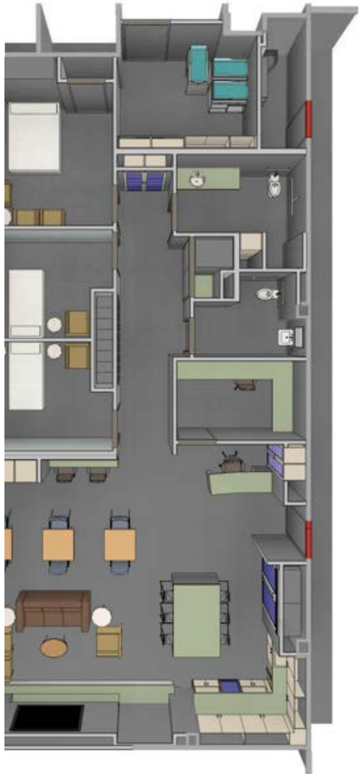
RMHC FAMILY SPACE PLAN